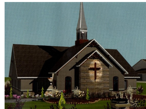
Artist depiction of proposed chapel.

Since we have begun the process of design, development, and obtaining approvals from local government agencies, the cost for materials and construction has risen approximately one million dollars from the original estimate. Please help us pray that we will be able to see this project completed for the glory of God and the spiritual enrichment of all clients. If the Lord lays it on your heart to contribute for this project, we would be deeply grateful. Please indicate the purpose of your gift when you donate online ( newdestiny.com ), or by mail using the donor form on page 7.